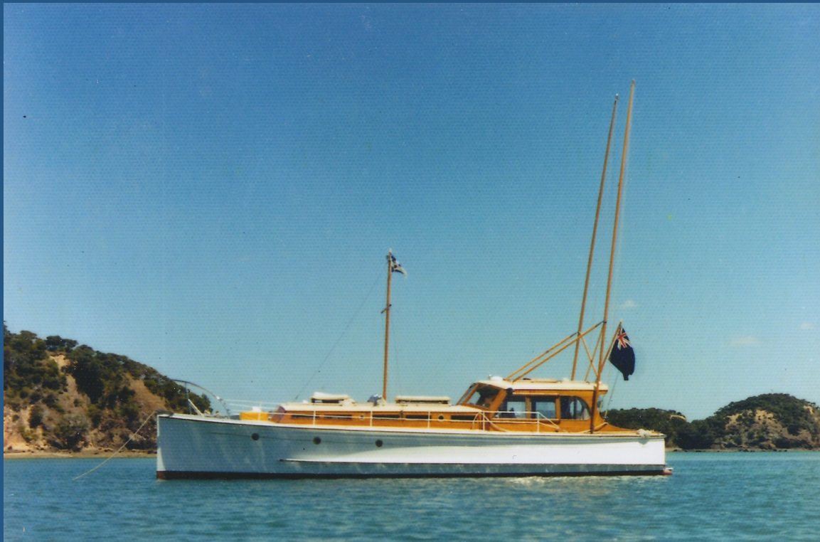
Anchored in the Bay of Islands