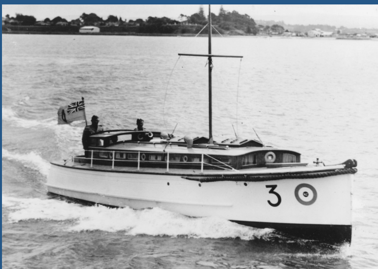
Tauranga during World War II