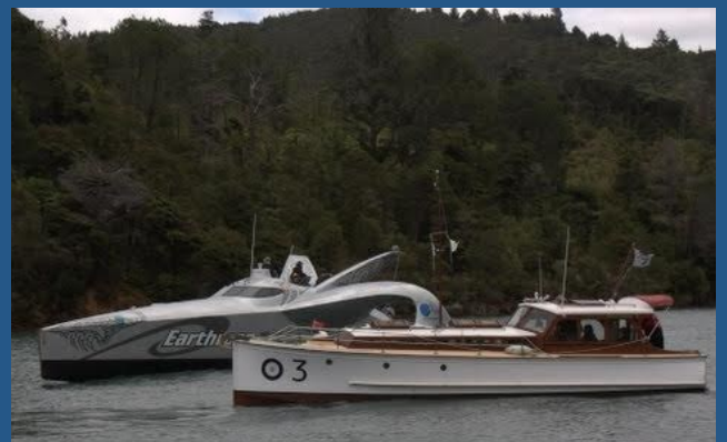
Winsome II and Earthrace