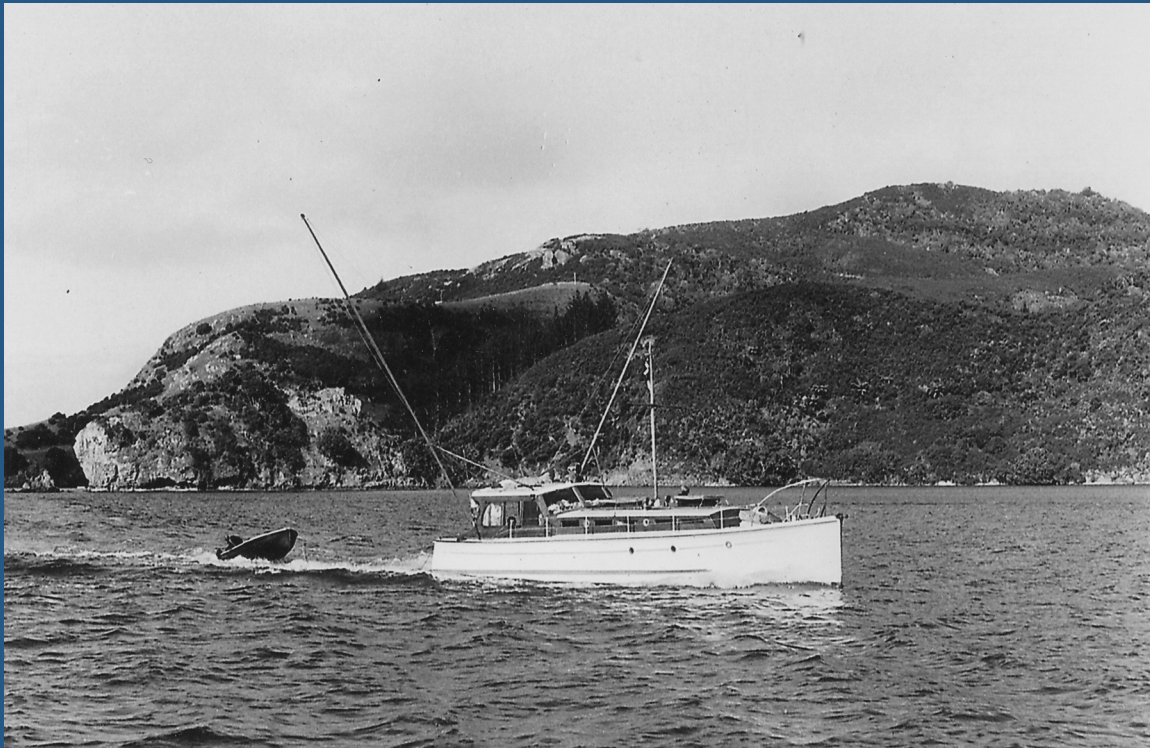
Cruising in the Bay of Islands