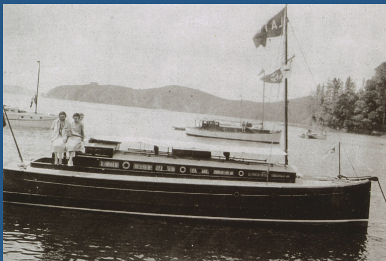
MV Maude T Waitemata Harbour Circa 1930s