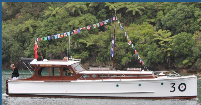
Winsome II , Queen Charlotte Sound 2017