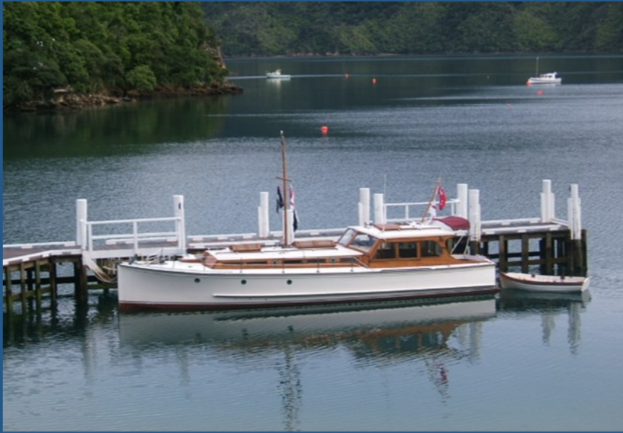
Winsome II on a Jetty in the Marlborough Sounds