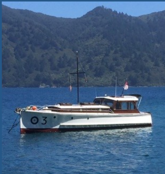
Winsome II moored Endeavour Inlet, Queen Charlotte Sound 2017