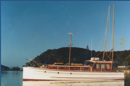
Anchored in the Bay of Islands Circa 1960s