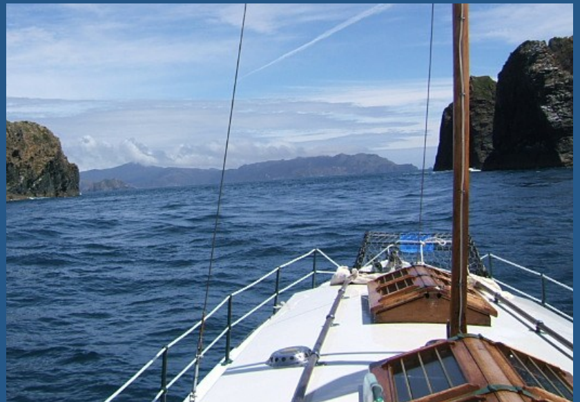
Winsome II entering Hell's Gate, D'Urville Island