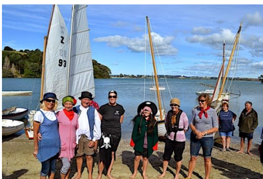
Seafarers ready to do battle