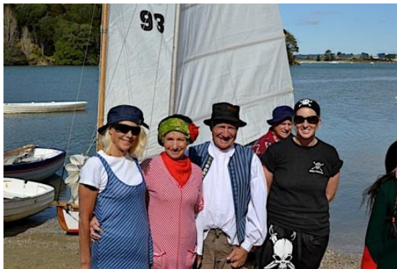
Rather friendly pirates, I guess from the same ship