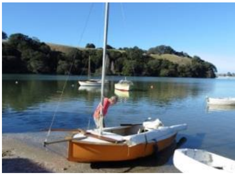
The winner carefully surveying his craft