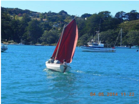
Cutter crew shoving off