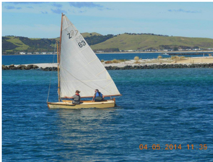
Just messing about in boats the perfect way