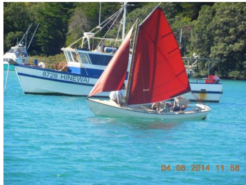
We should have handicapped you steve